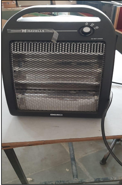
Photo of room heater given by Student of BAMS Batch-2023