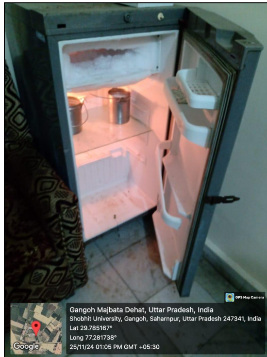
Photo of refrigerator given to Hostel by Student of BAMS Batch-2020