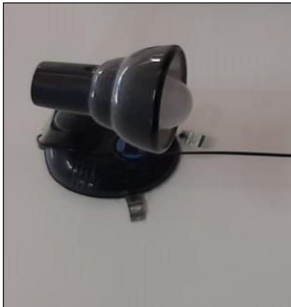
Photo of Table Lamp given by Student of B.Tech. Batch-2023