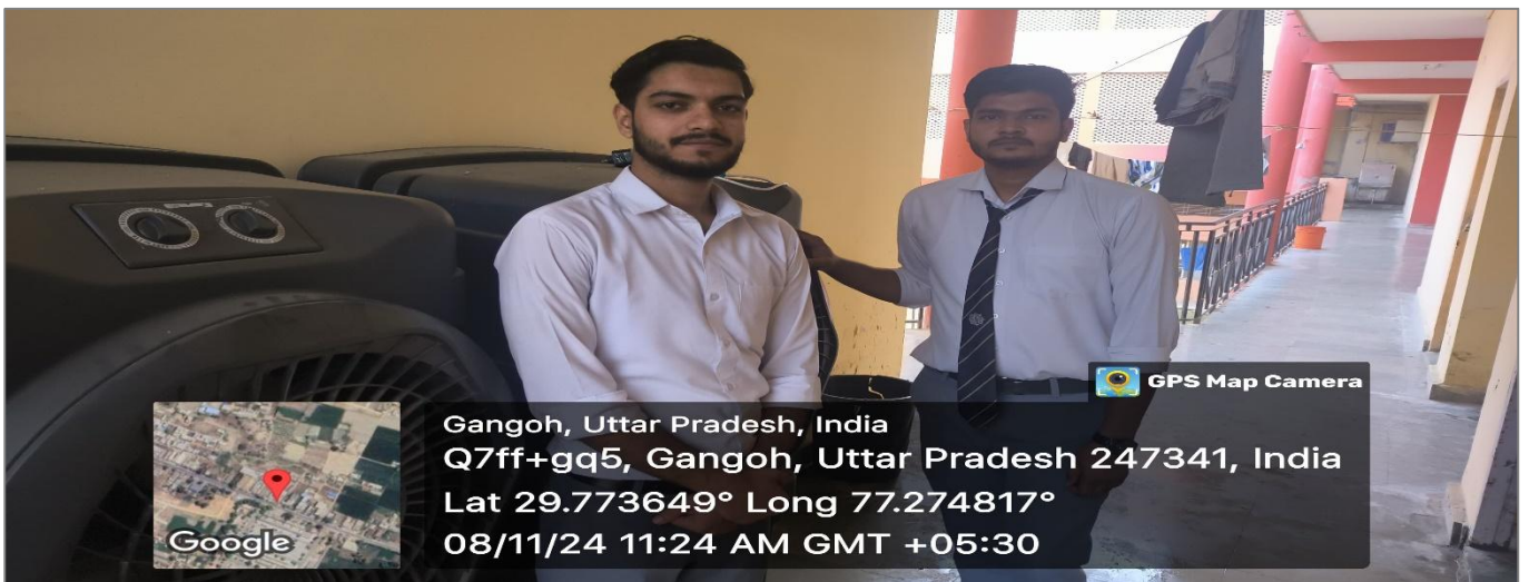
Some glimpses of the air coolers given to the hostel students by the alumni