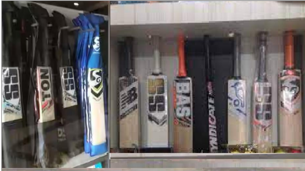
Photo of sports goods given to hostel students by BAMS Batch-2023