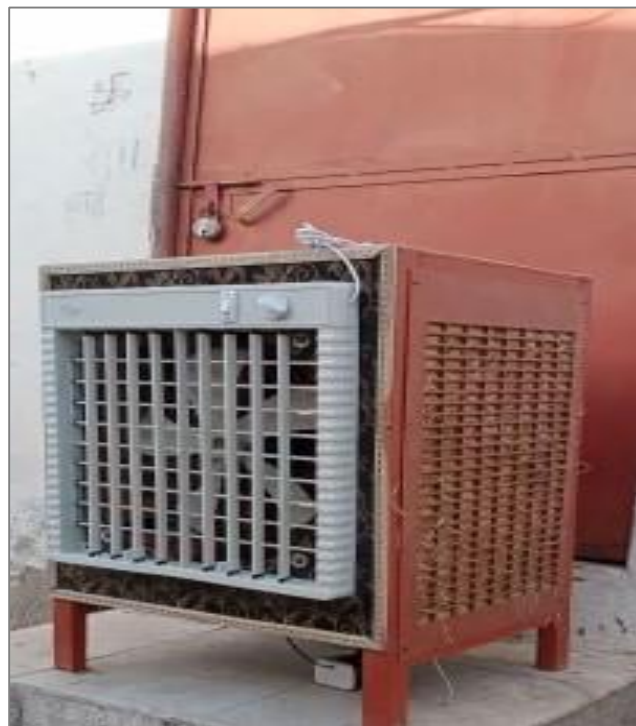
Photo of Air Coolers given to hostel students by BAMS Batch-2021