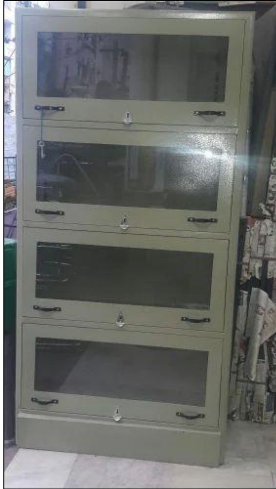
Photo of bookshelves given by Student of BAMS Batch-2023