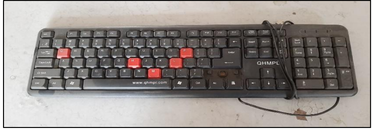
Photo of keyboard given by Student of B.Tech. Batch-2022