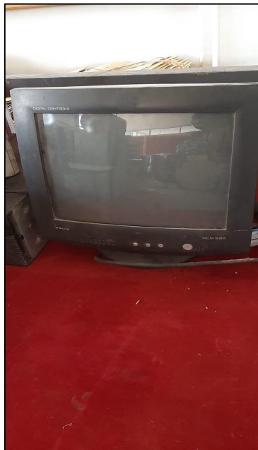
Photo of Printer and computer monitor given by Students of MCA Batch-2020