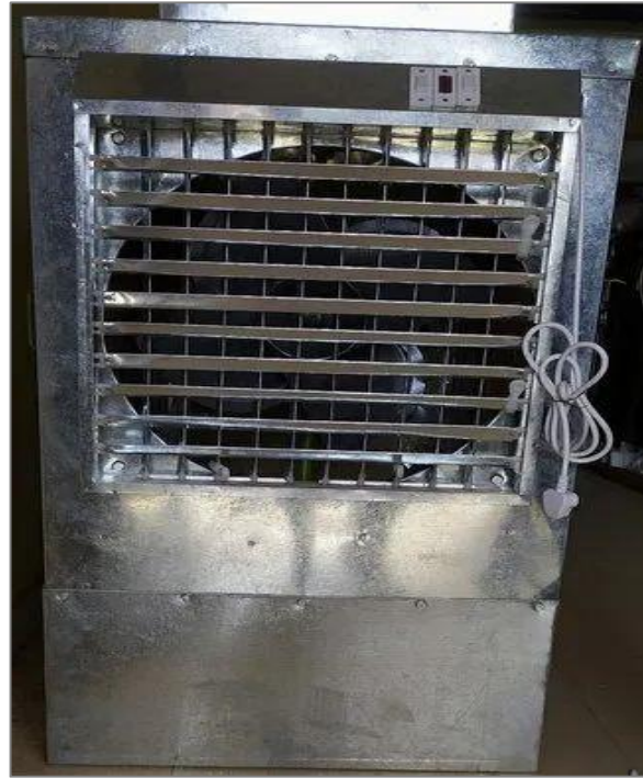
Photo of Air Coolers given to hostel students by BAMS Batch-2023